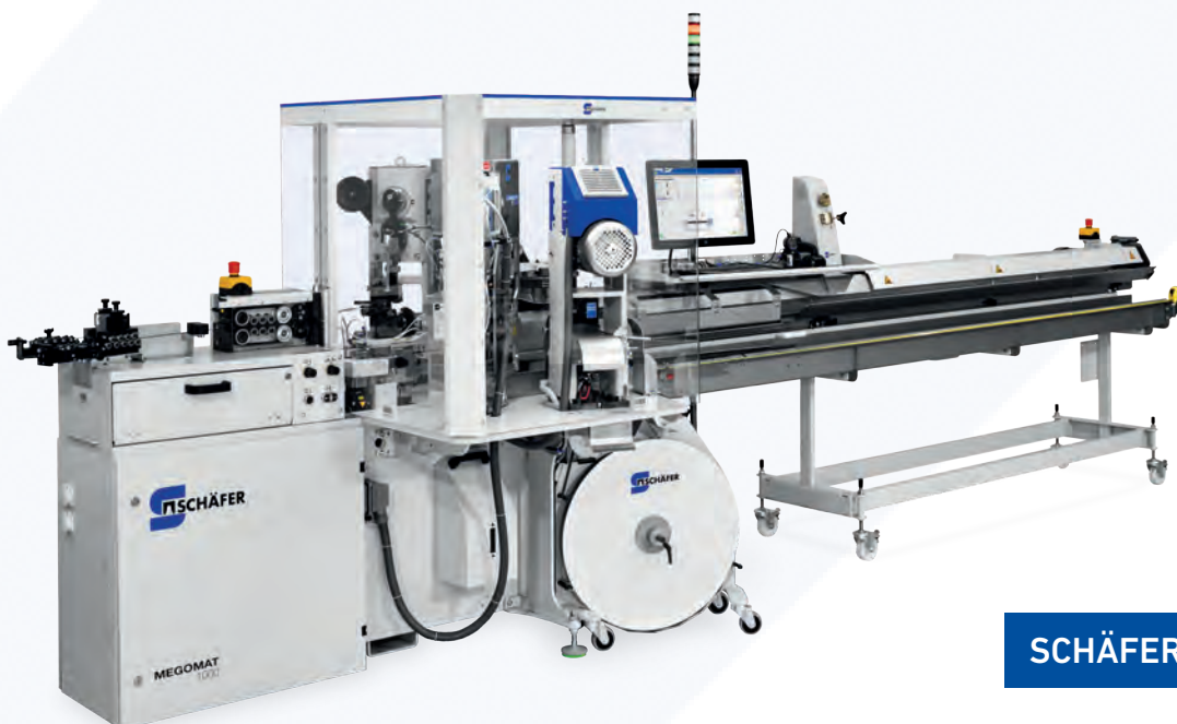
SCHÄFER MEGOMAT 1000

Schäfer offers fully automatic crimp machines for high productivity and various applications. On a modular platform different variants of Megomat machines were developed, to achieve maximum flexibility and meet customer specific requirements.